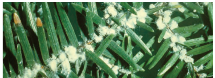
Hemlock Woolly Adelgid