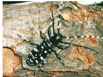
Asian Longhorned Beetle