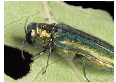
Emerald Ash Borer